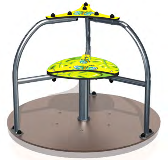
4 Tournicolo Carousel with Grafic Amazone finish (J2401-GA)