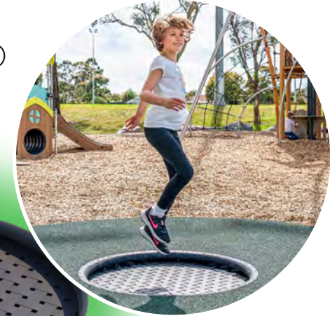
5 Round Trampoline (R34-ETP-010-R) *supplied with PlayPro Ring