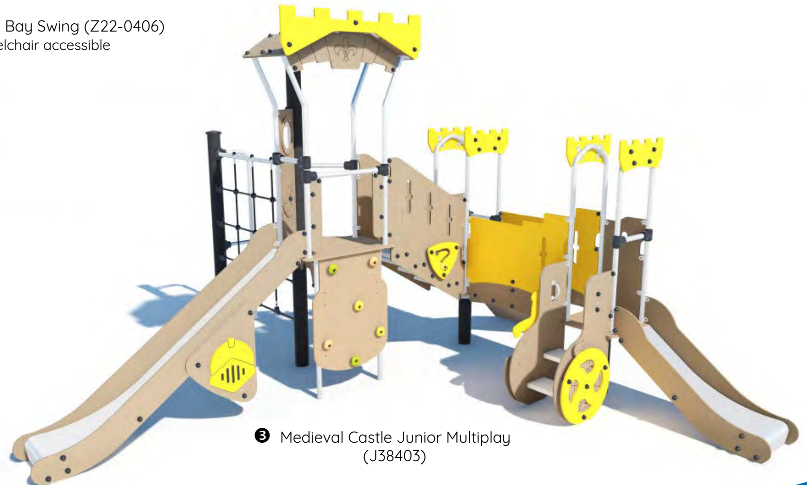
3 Medieval Castle Junior Multiplay (J38403)