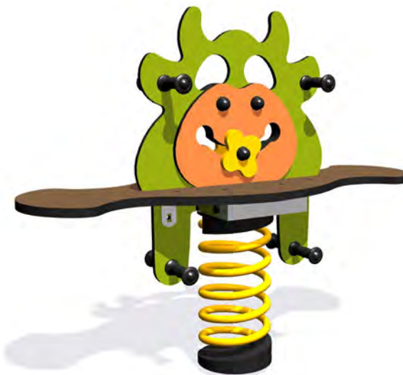
8 Marguerite Cow Seesaw Springer (J844)