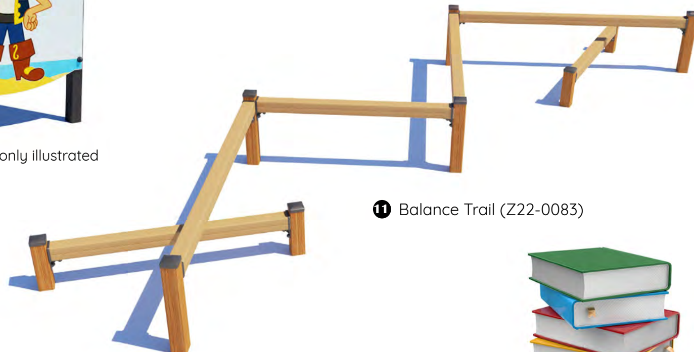
11 Balance Trail (Z22-0083)