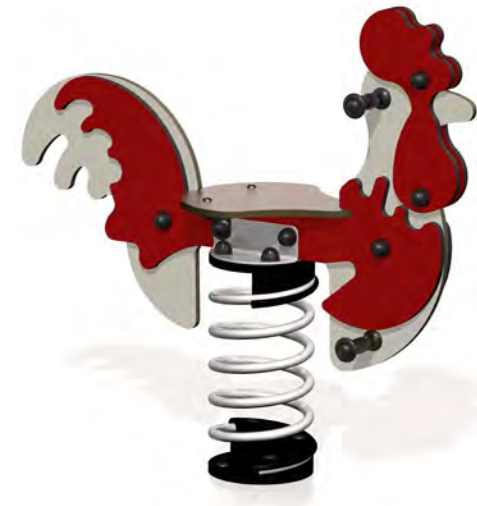
7 Chicken Springer (J802)