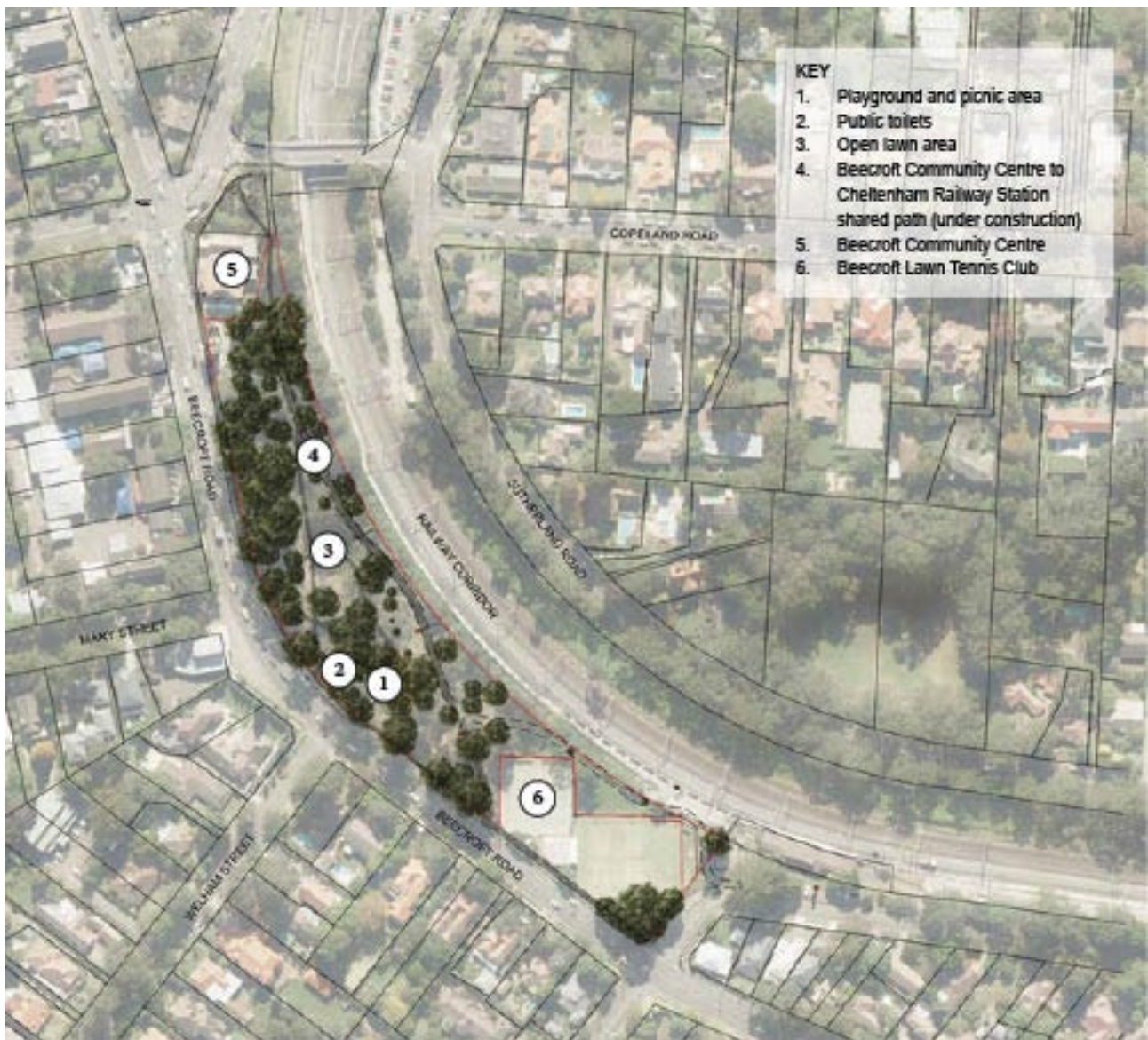
Image 1 - Beecroft Village Green Existing Site Plan

Beecroft Village Green is a parkland located at 111X Beecroft Road, Beecroft. The park is bounded by Beecroft Road to the west, the Northern Railway Line to the east, the Beecroft Community Centre to the north and Beecroft Lawn Tennis Club to the south.