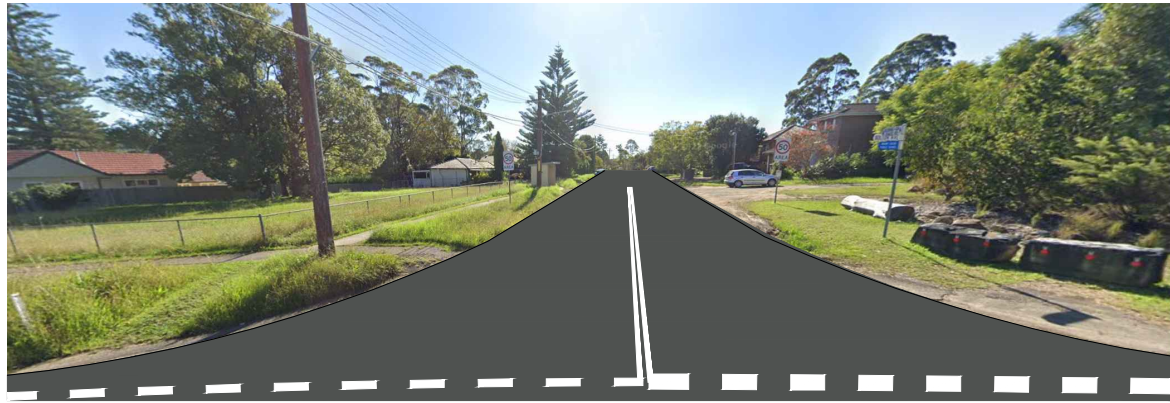
BOLTON AVENUE LOOKING NORTH FROM KURING-GAI CHASE ROAD