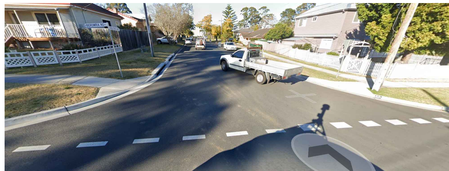
BOLTON AVENUE LOOKING SOUTH FROM BEROWRA ROAD INTERSECTION

PRELIMINARY NOT FOR CONSTRUCTION ISSUED FOR INFORMATION ONLY