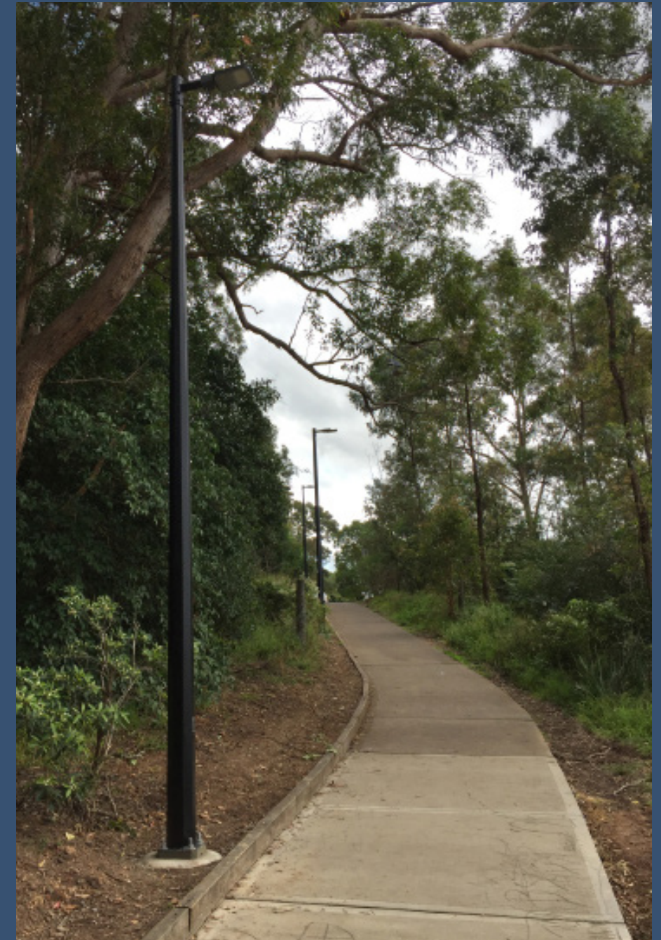
Example of existing pedestrian pathway lights