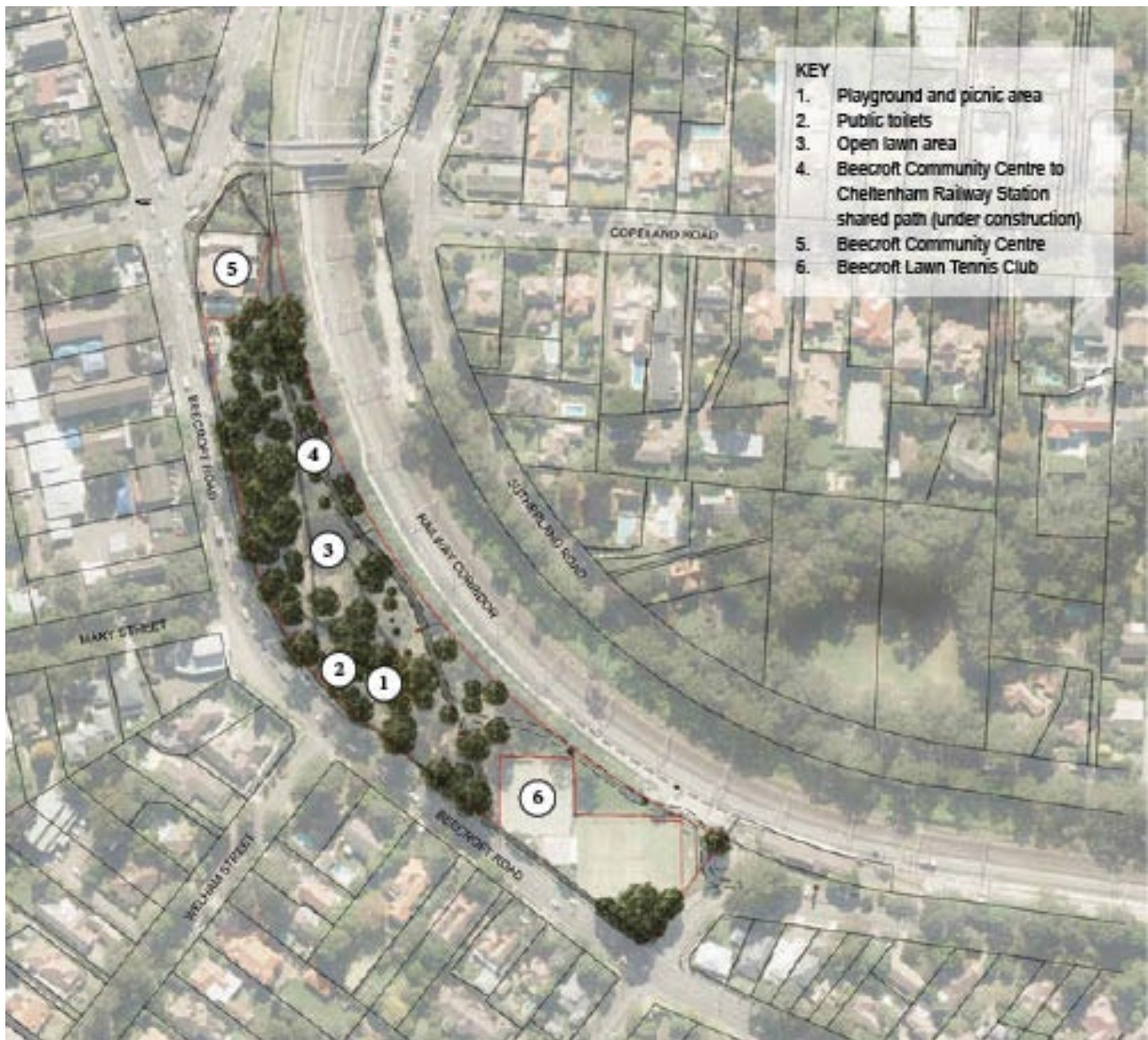
Image 1 - Beecroft Village Green Existing Site Plan

Beecroft Village Green is a parkland located at 111X Beecroft Road, Beecroft. The park is bounded by Beecroft Road to the west, the Northern Railway Line to the east, the Beecroft Community Centre to the north and Beecroft Lawn Tennis Club to the south.