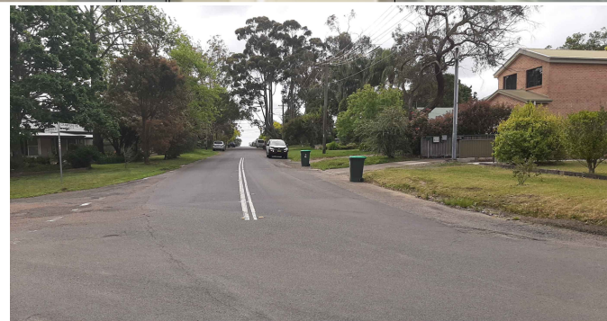
CRAWFORD ROAD LOOKING NORTH FROM GLENVIEW ROAD