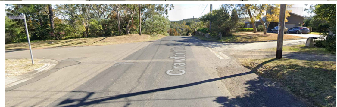
CRAWFORD ROAD LOOKING NORTH FROM FAIRVIEW PLACE INTERSECTION