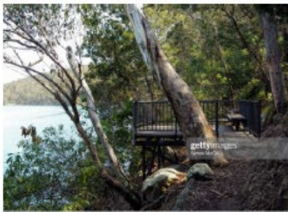
Example - Viewing Platform