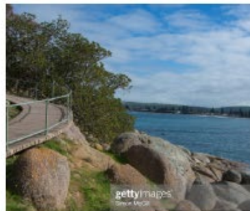
Example - Viewing Platform