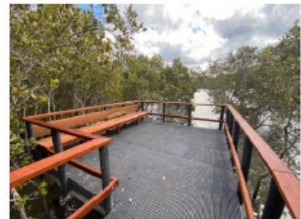
Example - Viewing Platform

Natural Resources Branch Hornsby Shire Council 296 Peats Ferry Road, Hornsby PO Box 37, Hornsby NSW 1630 Telephone 9847 6666 8.30am - 5pm Mon-Fri hornsby.nsw.gov.au