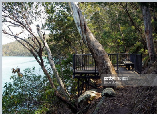
Example - Viewing Platform