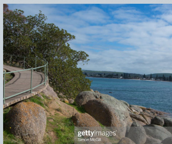
Example - Viewing Platform