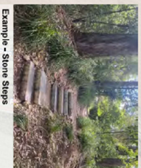
Example - Stone Steps