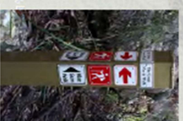
Example - Track Head and Directional Signage