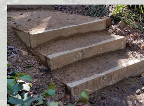
Example - Timber Steps