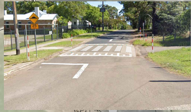
SCHOOL ROAD ARTIST'S IMPRESSION OF PROPOSED CROSSING

PRELIMINARY NOT FOR CONSTRUCTION ISSUED FOR INFORMATION ONLY