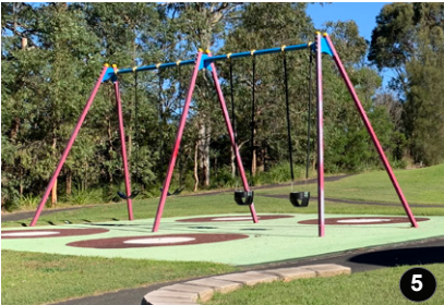
Existing swings - refurbished