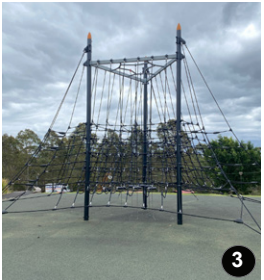
Existing net structure