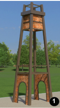
Custom chimney tower