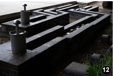
Waterplay with brickwork