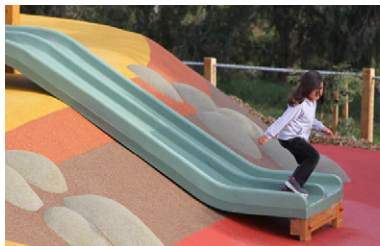
Junior twin slide