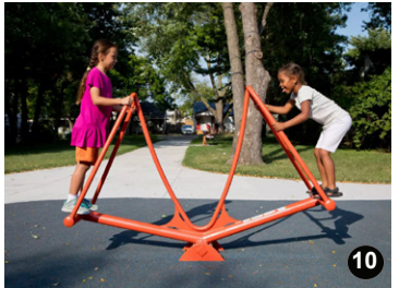
Stand up see-saw