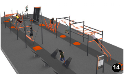
Ninja warrior course