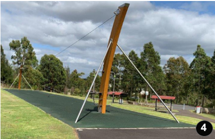
Existing flying fox