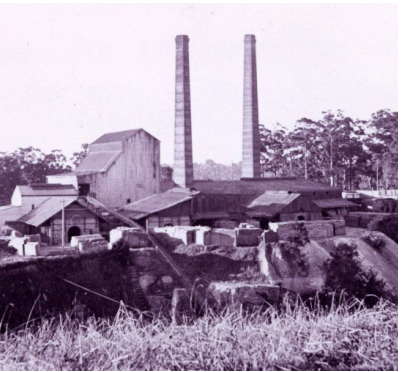
National Brickworks former structures onsite